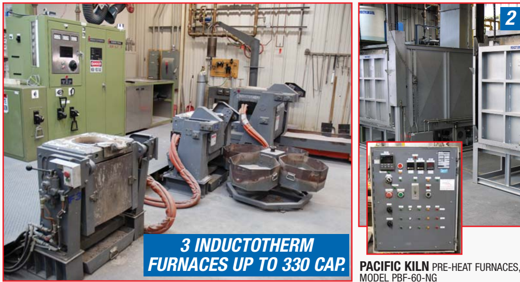
1993 INDUCTOTHERM 125 KW INDUCTION POWER SUPPLY, MODEL iPOWER-TRAK 125-30R