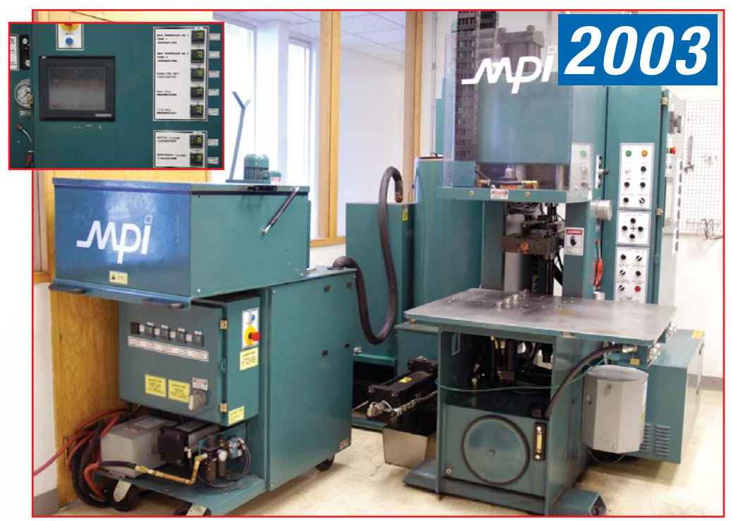
M.P.I. 25 TON WAX INJECTION PRESS, MODEL 55-25-18