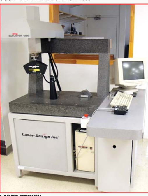
LASER DESIGN LASER CMM. MODEL SURVEYOR 1200