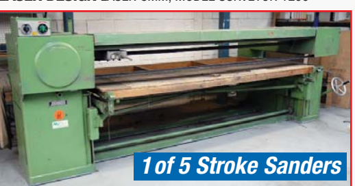
JOHANSEN HORIZONTAL BELT SANDER, MODEL T-88K