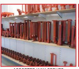
ASSORTED WAX SPRUES, BASES AND HEADS