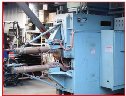
TAYLOR WINFIELD SP0T WELDER. MODEL ERB-36-100