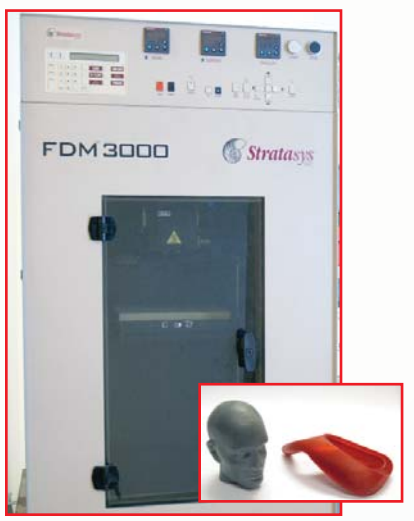
STRATASYS WAX PROTOTYPE MACHINE, MODEL EDM 3000