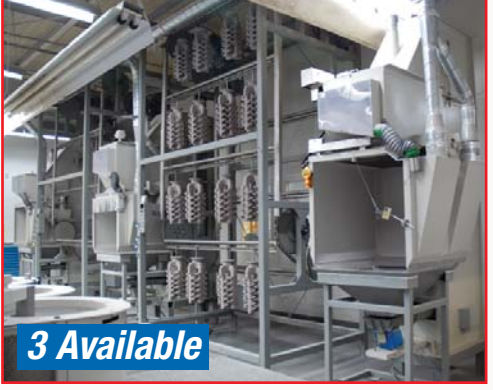
TWO STAGE RAINFALL TYPE INVESTMENT COATING CHAMBERS, PLUS DUAL ELEVATOR DRYING SYSTEM

We will be happy to bid on your behalf if you are unable to attend our auction. Please call our office at 1-866-669-8893, or visit our websites to submit a proxy bid. www.infassets.com or www.machinervnetworkauctions.com