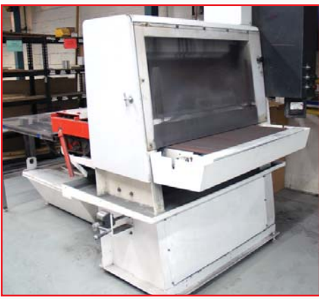
AEM 36" METAL BELT SANDER, MODEL MEF-29-90