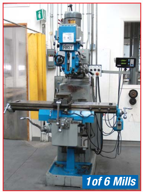
FIRST MILL MODEL LC 185 VSX