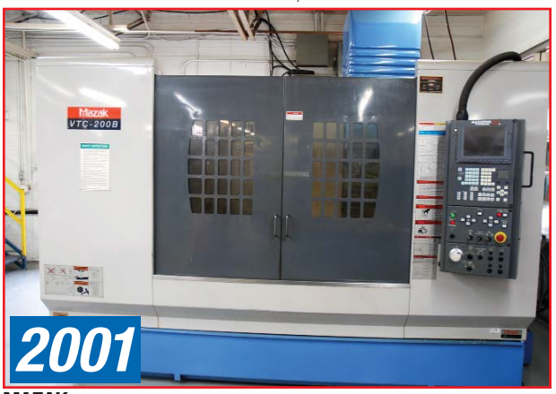
MAZAK CNC VMC, MODEL VTC-200B