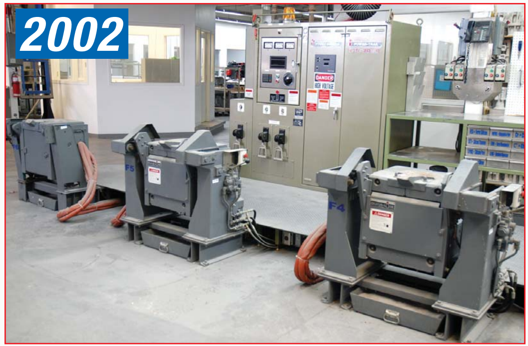
INDUCTOTHERM 175KW INDUCTION POWER SUPPLY, MODEL iPOWER-TRAK 175-30CR