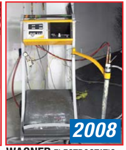
WAGNER ELECTROSTATIC POWDER COATING GUN