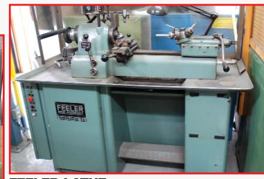
FEELER LATHE MODEL FTS-27