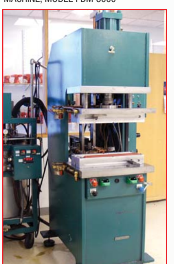
WAX INJECTION PRESS