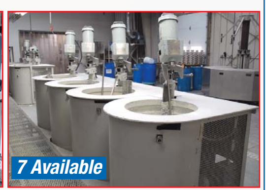
LIGHTNIN MODEL XJ117 INVESTMENT CASTING