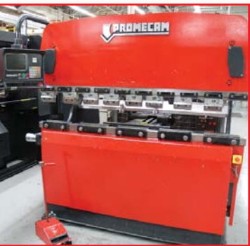
PROMECAM 6' 7" X 55 TON HYD. PRESS BRAKE, MODEL 1T2-050-20