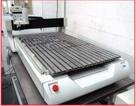
HERMES GRAVOGRAPH. MODEL IS8000